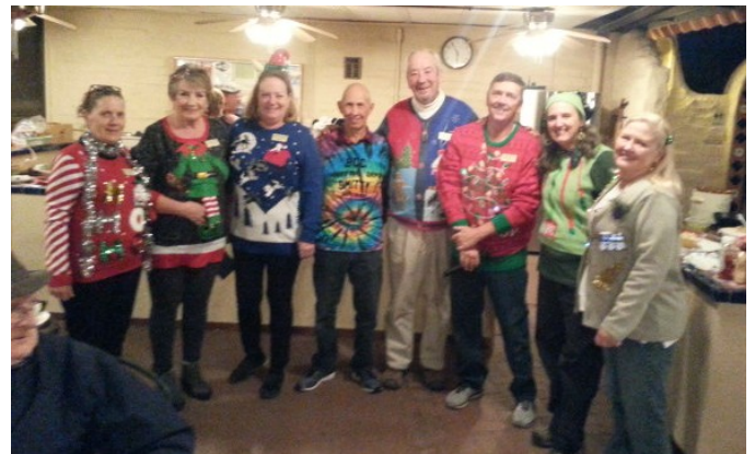
Ugly Christmas Sweater Contestants